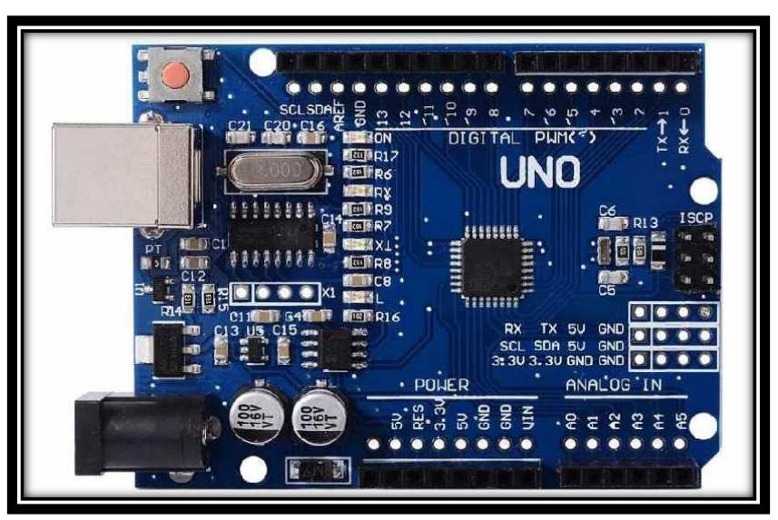
Figure 1. Arduino Uno cart.

Arduino is an open source physical programming platform (Dokmetas, 2016). It can considered as a stand-alone computer. Arduino does not only consist of microcontroller cards, it is also the most preferred project development platform with its extensive library, sample projects and easy-to-learn language. Arduino's programming language is the most common C / C ++ language (Dokmetas, 2016). Arduino can be downloaded for free from its official site (Arduino, 2017). Arduino cards are very easy to obtain and programming is becoming more fun. The Arduino card is shown in Figure 1.