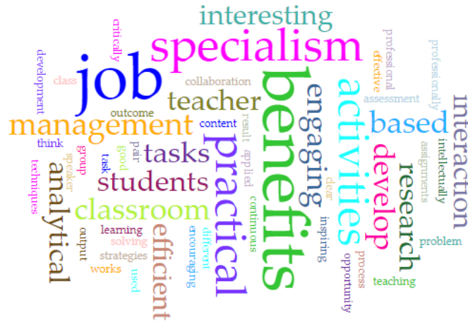
Figure 3. The frequency of the use of the terms identified by the Voyant Tools in the corpus of the students' responses to the first question

The relative frequencies of the most frequent terms in the students' responses to Question 1 were as follows: the relative frequency for "benefits" was 0.296, the Rel. freq. for "job" was 0.288, the Rel. freq. for "specialism" was 0.281, the Rel. freq. for practical was 0.274, and the Rel. freq. for "activities" was 0.263.