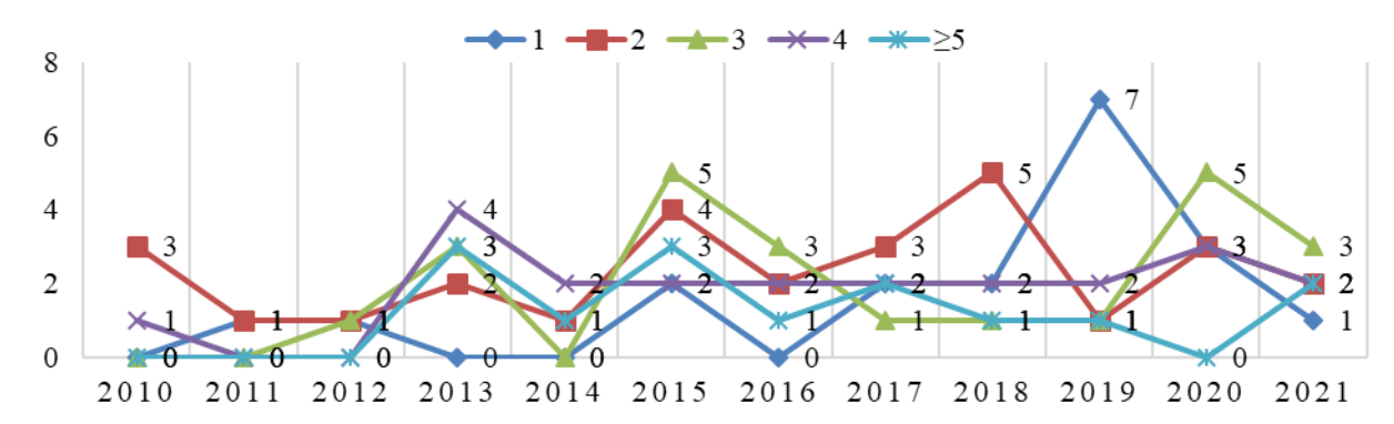
Figure 4. Number of Authors in TPACK Research by Year

When analyzed by year, in 2019, the number of single-author articles was the most, reaching the peak with 7 papers. In addition, the number of four author papers stagnated between 2014 and 2019 before finally increasing in 2020. The increase also occurred in papers with two authors from 2016 to 2018. This implies that collaboration in research on TPACK mostly comes from groups of authors who work in at least 2 affiliates. As can be seen from Figure 4, overall among 106 papers, less than one-fifth (17.92%; n = 19) of papers are single-authored and the most frequent papers published in TPACK research have 2 authors (26.42%; n = 28). Interestingly, more than half (55.56%; n = 59) of publications were written by at least 3 authors between 2010 and 2021.