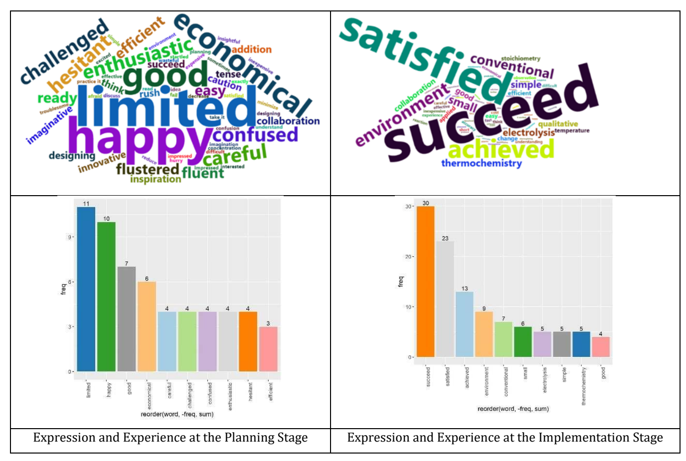
Figure 5. Word Cloud Analysis on the Reflections of Chemistry Educators

Phase V (Reflect): Evaluation of the Practicum Design Based on the SSC Approach