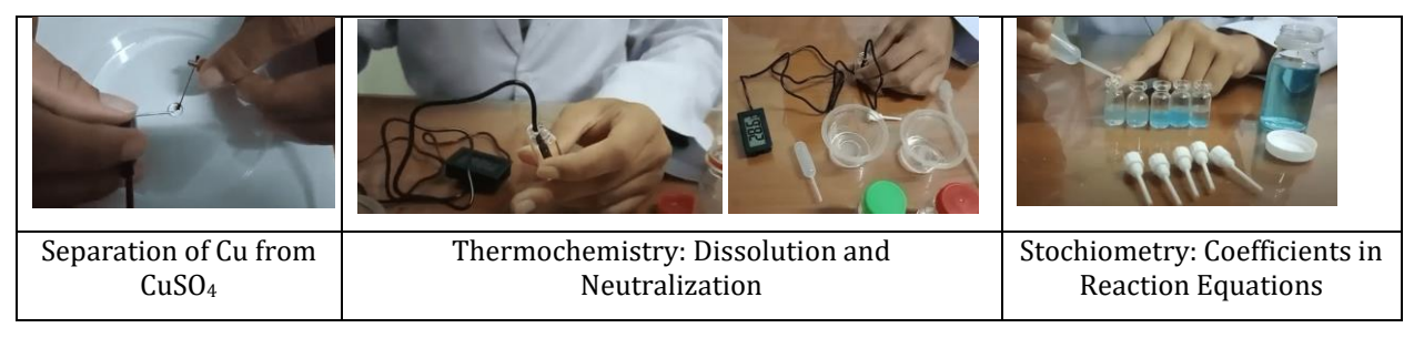
Figure 4. Alternative Proper Design Results With Availability of Tools and Materials

This stage analyzes the experiences of participants in implementing the SSC approach in practical activities. Based on the availability of tools and materials, three alternative types of practicum can be done covering the topics of electrochemistry, thermochemistry, and stoichiometry. This is shown in Figure 4. The topic of electrochemistry is related to the separation of Cu from CuSO<sub>4</sub> solution. In this practicum, conventional volume modification of CuSO<sub>4</sub> was demonstrated, which is usually a few ml, in SSC-based activity using only 2-3 drops of solution. This is also shown in the measurement of temperature in measuring the heat absorbed in the dilution and neutralization reactions. The use of a 2 ml perfume bottle and the use of only about 5-10 drops of the solution is applied in a practical design by measuring with a digital mini-thermometer. The use of this 2 ml perfume sample bottle container is also used in stoichiometry practicum, observations on differences in precipitate height are used to identify the coefficients of the reaction.