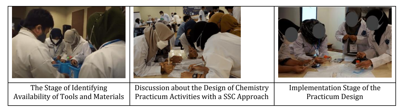
Figure 3. Stages of Designing and Testing Laboratory Activities Based on Small-Scale Chemistry