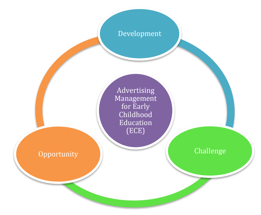
Figure 1. Navigation Chart for Early Childhood Education Advertising Management

This study aimed to fill a gap in existing research and provide an overview of the application of supportive management in the ECE setting. In addition, this research paper detailed the historical developments, opportunities, and challenges of advertising management in ECE. The findings were presented as a guide for teachers, schools, and parents. In addition, this research helped education policymakers manage ECE advertisements under the school's needs, vision, mission, and goals.