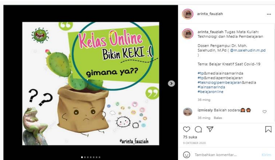
Figure 3: The results of students' new products in visual media learning- Instagram

Creating new products produced in learning was all students' works through formulating, planning, and producing. The example on the https://www.instagram.com/p/CGHZomQpjMZ/?igshid=1rq08sx0qajpu account was the creation of a new visual product of the students which created using Canva and uploaded on Instagram. See the following image: