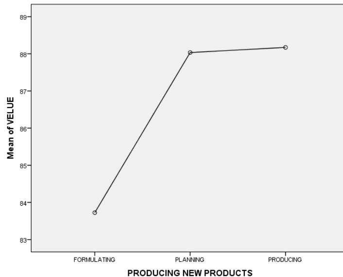
Figure 4: Detrended Normal Q-Q Plots

Among the three stages of creating new products, producing new products was the greatest with the significance value greater than > 0.05 both in the Kolmogorov-Smirnov test and in the results of the Shapiro-Wilk Tests. A clear image of the results can be seen in the QQ Plots image as follow: